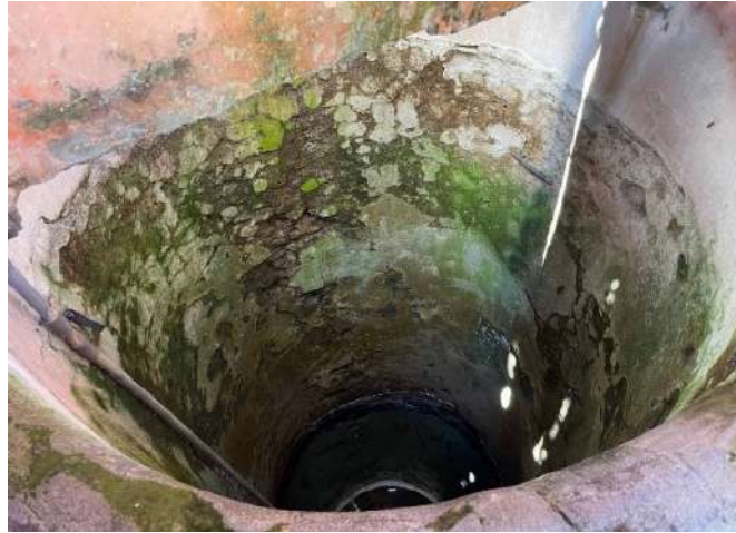
Figure 3. The Old Dutch Well, Still Functioning as a Center for Social Activity and a Symbol of Sustenance for the Lae-lae Community.

an old well from the Dutch colonial era. Physically, the well appears modest, with a diameter of approximately 180 centimeters and a wellhead rising 70 centimeters above the ground. For the residents, however, this well is not merely infrastructure. It is a mythological artifact that marks the island's genesis of civilization. A firmly held belief asserts that this well has existed for decades and marks the very beginning of community life on Lae-lae.