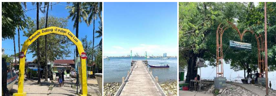
Figure 6. The Kayu Bangkoa Pier, the Main Access Point for Tourists and the Community to Lae-lae Island.

In terms of Accessibility, Lae-lae Island possesses a significant competitive advantage due to its proximity to the center of Makassar City. The travel time is only 10 to 15 minutes by traditional boat or speedboat from the Kayu Bangkoa Pier. However, this ease of access is also a double-edged sword. It encourages very short visitation patterns, where tourists arrive and depart quickly without feeling the need to stay longer and explore more deeply. Meanwhile, internal accessibility on the island is adequate, with established footpaths. However, there is no system of signage or interpretation to guide tourists to the narrative sites scattered across various locations.