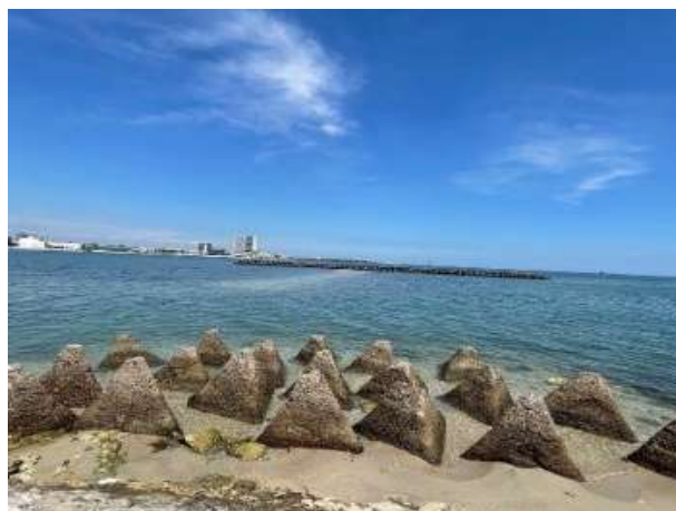
Figure 5. The Ancient Stone, Believed to be a Symbol of Community Protection, is Located Near Other Sacred Areas.

Completing the narrative landscape of Lae-lae Island is an ancient stone of unique shape, located near one of the sacred tomb sites. Unlike the other narratives tied to history (the bunkers) or vital functions (the well and tombs), the narrative of this ancient stone is more subtle and rooted in an animistic cosmology. Some community members believe the stone is a kind of ‘talisman’ or ‘guardian’ of the island that has existed since the time of the first inhabitants. Its existence is not the result of a recorded historical event. It is part of ancestral knowledge, passed down as a vague yet persistent belief.