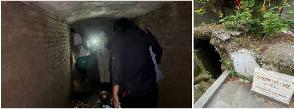
Figure 2. One of the Japanese Bunkers on the Southern Side of Lae-lae Island is a Physical Artifact Serving as a Vessel for the Community's Collective Memory.

The narrative layer enveloping these bunkers extends far beyond a mere historical record of their function as defensive fortifications. For the Lae-lae community, these bunkers have transformed into sites of memory ( lieu de mémoire ). This concept refers to points where a community's collective memory resides. These bunkers serve as a stage for oral stories about the suffering, resistance, and endurance of their ancestors during the war. Their silent yet sturdy presence serves as a constant reminder of the history that has shaped the island community's character. More than just old piles of concrete, these bunkers are unofficial monuments that continuously 'speak' to new generations about their origins and struggles.