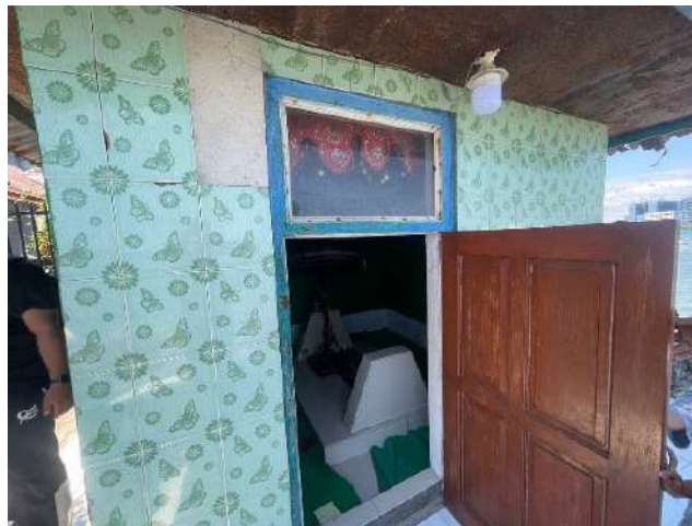
Figure 4. One of the Sacred Tombs at the Island's Edge, a Ritual Center Reflecting the Maritime Spirituality of the Lae-lae Community.

The core of the Lae-lae community's cosmology, which fundamentally shapes their relationship with the sea, manifests in two old tomb complexes considered sacred. Located at the island's extremities, these tombs' geographical positioning symbolically establishes them as 'guardians' or 'spiritual gateways' between the land and the sea. Their status as sacred sites indicates that these are not merely ancestral resting places. They are sacred spaces where the boundary between the human and the supernatural worlds becomes thin. These spaces are central to ritual practices that govern nearly every aspect of the community's maritime life, which is primarily fishing.